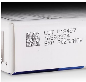
Pharma – paperboard

* Subject to availability in your country