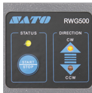
User-Friendly Operation Panel