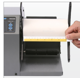
Up to 7-inch Wide Label Support