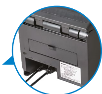
Space-saving recessed ports