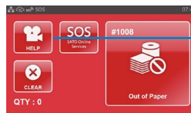
Guidance video button on red error screen

Useful for operator training, our onboard guidance videos are also easily accessible when operator encounters error. This helps to speed up troubleshooting to minimise downtime.