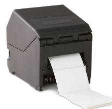
Fanfold media loading from the rear