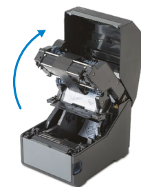
Wide opening of top cover for media loading